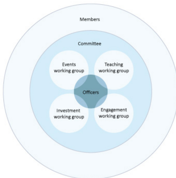
The governance structure for UACES

The Association is governed by a Committee which includes a Chair, a Secretary and a Treasurer. In addition to the Committee, there are working groups which undertake specific tasks. The student members of the Association are represented by the UACES Student Forum.