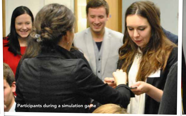
Participants during a simulation game