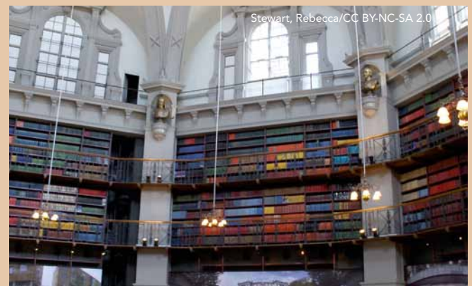
The Octagon, Queen Mary University of London

London is one of the most diverse cities in the world with a kaleidoscope of cultures, people and history. This is particularly noticeable in London's East End, a rapidly developing part of the city, and destination for the 2016