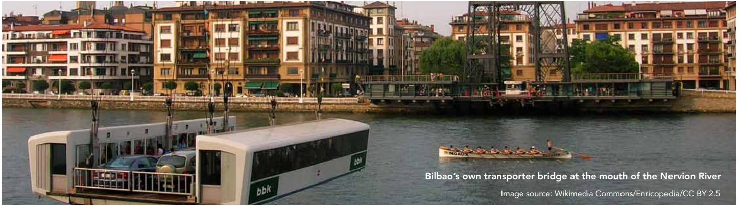
Bilbao's own transporter bridge at the mouth of the Nervion River